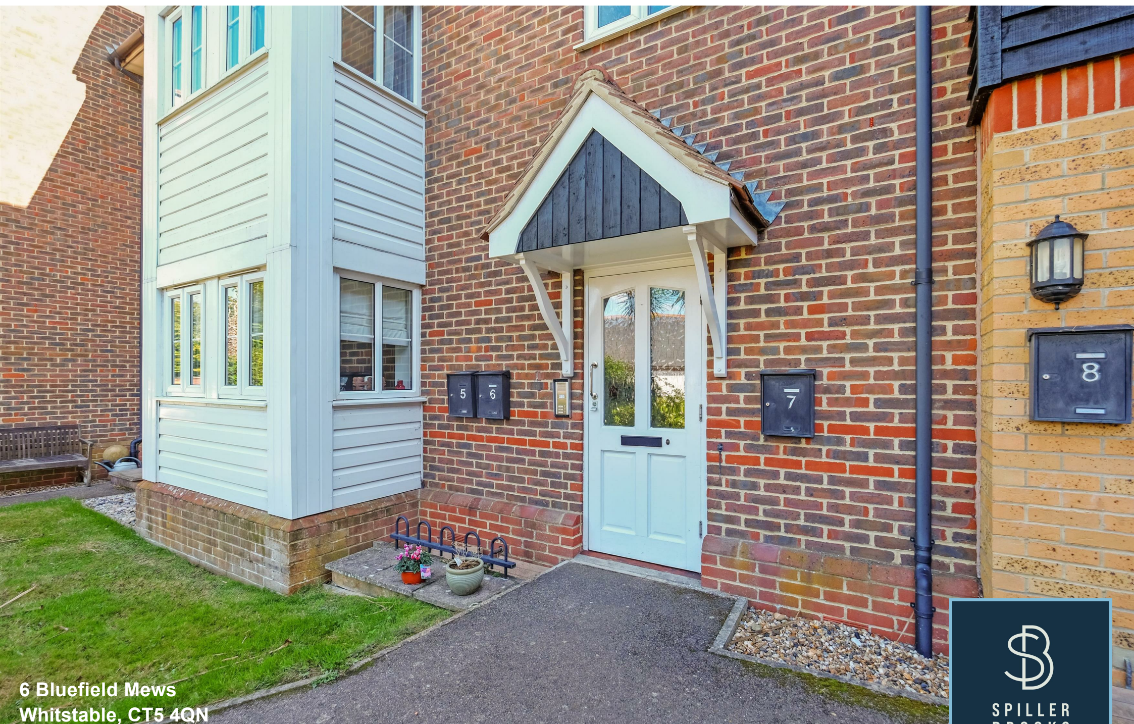
6 Bluefield Mews Whitstable, CT5 4QN